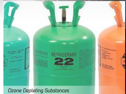
Ozone Depleting Substances